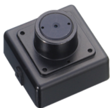
MINI-540CO Flat Pinhole option