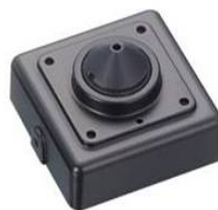
MINI-CN4 Cone Pinhole option